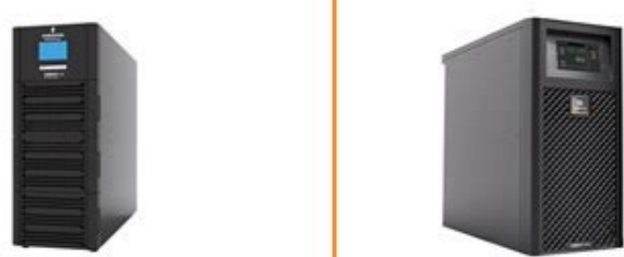
Emerson ups 6kva pdf.